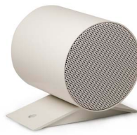
ELSII-10PM Network Projector