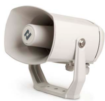
ELSII-10HM Network Horn Speaker,