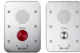
Vandal Resistant Intercom