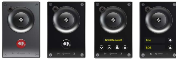
Turbine Intercom Audio and Video Stations - TCIV+ Series