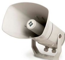
ELSII-10LHM Network Long Horn