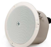
ELSIR-10CM Network Ceiling