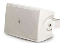
ELSII-10WM Network On-Wall