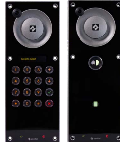
Turbine Extended Series