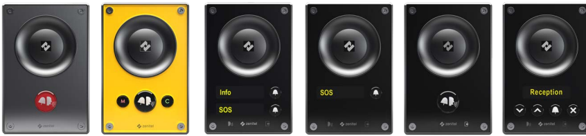
Turbine Intercom Audio Stations - TCIS Series

Zenitel's intercom solutions combine unrivalled HD audio and video. Empower your security team with the proven power of Turbine, so they can act in real time and with clear communication. Our Turbine family is designed to withstand treacherous situations including extreme fluctuations in temperature, vandalism, noisy, dirty, and dusty environments.