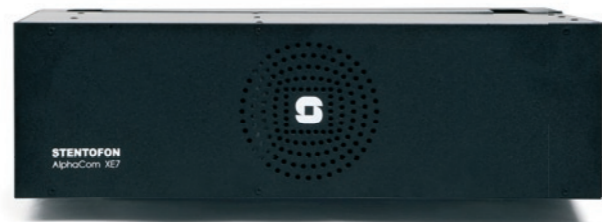
3 UNIT HIGH AUDIO SERVER SUPPORTS 2-552 IP STATIONS AND 36 ANALOG STATIONS