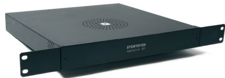
1 UNIT HIGH AUDIO SERVER SUPPORTS 2-552 IP STATIONS