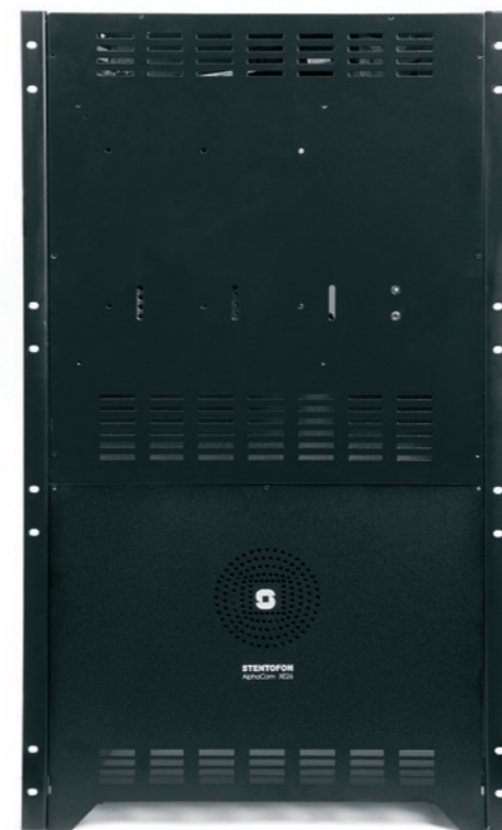
6 UNIT HIGH AUDIO SERVER SUPPORTS 2-552 IP STATIONS AND 102 ANALOG STATIONS