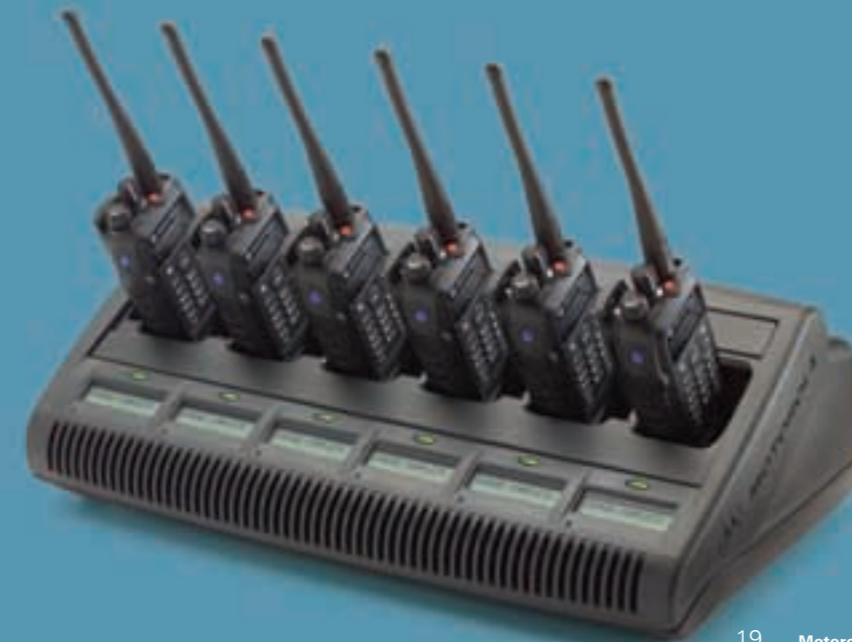
19 Motorola, Inc.

When used exclusively with IMPRES chargers, IMPRES batteries have six months more capacity warranty coverage than Motorola Premium batteries.