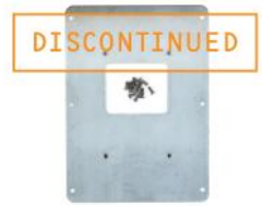
Turbine Adapter Plate

Bracket for US 2 GANG Double Depth Back Box