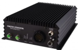
ENA2060-DC1 Network Amplifier

Exigo Network Amplifier 2 Channels, 60W for Rolling Stock