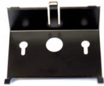
Wall Bracket for Desktop