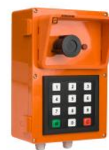
Industrial Master Station