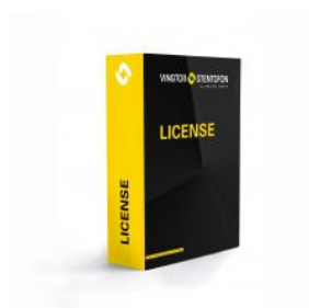
IP-ARIO Audio License