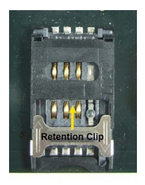
Figure 1: Retention Clip Closed

1. Slide the metal retention clip in the direction shown to open the card socket (Figure 1 & Figure 2).