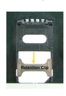
Figure 5: Socket Closed