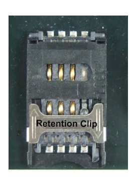
Figure 2: Retention Clip Open