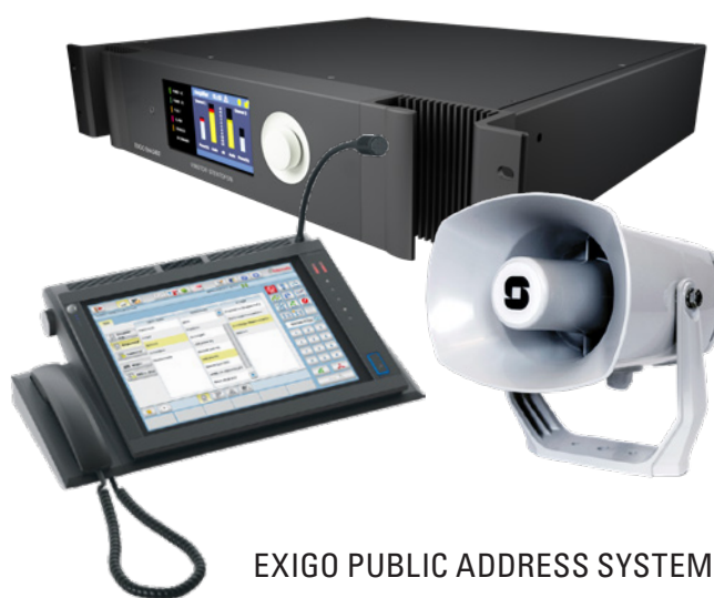
EXIGO PUBLIC ADDRESS SYSTEM

With our communication solutions, you have the technology that lets your staff respond quickly and efficiently to incidents in real-time, thereby helping to elevate the security of staff and infrastructure at all times.