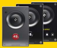
Turbine Video Intercom Station