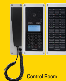
Control Room Master Station

See the full collection of IP call stations at www.zenitel.com .