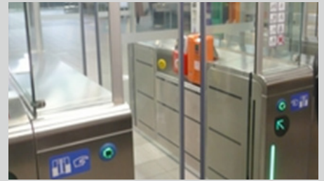
BRUSSELS METRO BRUSSELS, BELGIUM

Visit us online at zenitel.com for more information about our products and solutions.