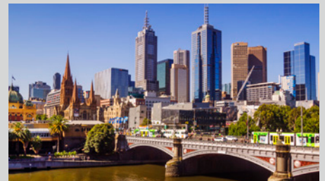
YARRA TRAMS MELBOURNE, AUSTRALIA