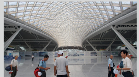
GUANGZHOU RAILWAY ST. GUANGZHOU, CHINA