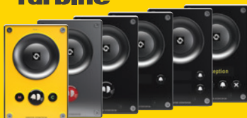
Turbine Intercom Stations