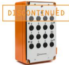
Industrial Master Station