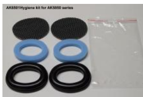
Hygiene kit for Headset

Spare Boom Microphone for all A-Kabel type Headsets