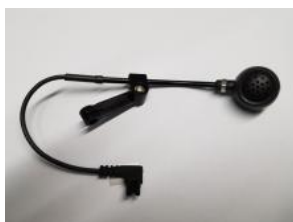
Spare Boom Microphone for Headset

Spare Boom Microphone for all A-Kabel type Headsets