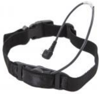
AK6070T Throat microphone for all A-kabel type Headsets