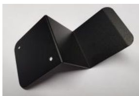
Headset Stowage Bracket

Headset stowage Bracket for Wall mounting