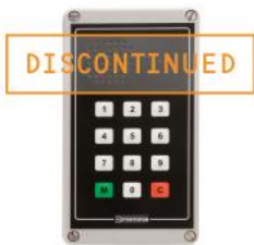
Light Industrial Master Station