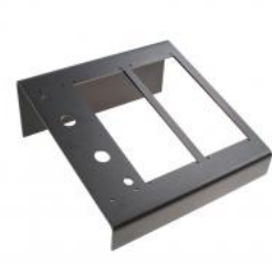
Triple support de bureau CRM-V