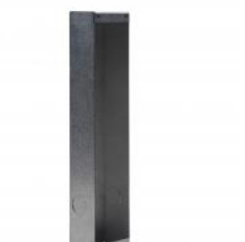
Flush mount back box