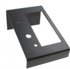
Double support de bureau CRM-V