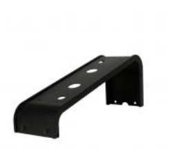
Support de bureau pour combiné