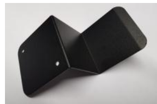
HEADSET STOWAGE BRACKET Item Number: 3006090494