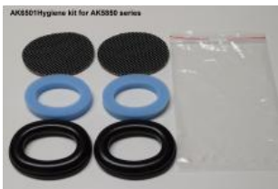
HYGIENE KIT FOR HEADSET Item Number: AK6501