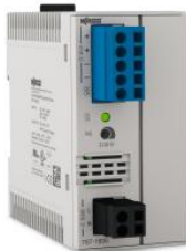
Power supply 100-240VAC/24VDC 2A