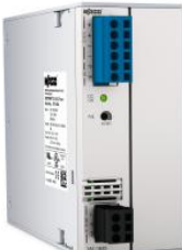
Power supply 100-240VAC/48VDC 5A