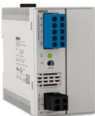
Power Supply 100-240VAC/48VDC 2A