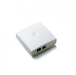
IP DECT Base Station IP Base Station for KWS6500