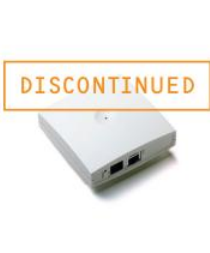
DECT Repeater DECT repeater 4-ch, multi-cell wo/ power supply