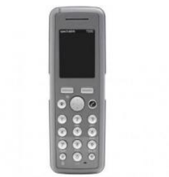
7212-FS DECT Handset DECT Handset, IP54. Frequency- Swapping 1G8/1G9/SAM