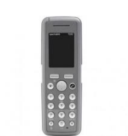
7622 DECT Handset DECT Handset, IP64