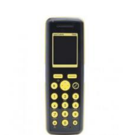
7642 DECT Handset DECT Handset with Bluetooth, IP64