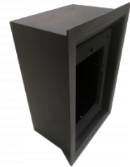
Turbine Compact Flush-Mount Back Box