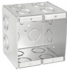
US 2-Gang 3½" Deep Backbox