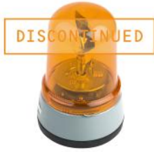
EHS-220O – Rotary Signal Light, 220 V AC (Orange)