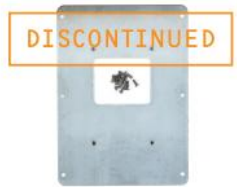
Turbine Adapter Plate

Bracket for US 2 GANG Double Depth Back Box