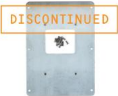
Turbine Adapter Plate