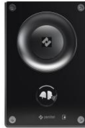
TCIS-3 | Audio Intercom