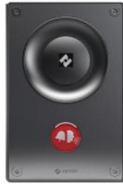
TCIS-2 | Audio Intercom