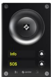
TCIS-5 | Audio Intercom