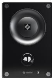
TCIS-3 | Audio Intercom