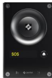
TCIS-4 | Audio Intercom