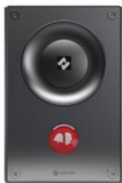
TCIS-2 | Audio Intercom