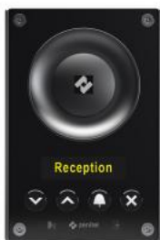
TCIS-6 | Audio Intercom