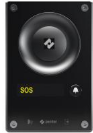
TCIS-4 | Audio Intercom