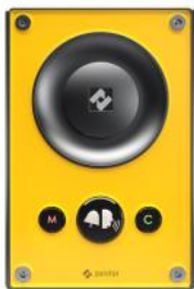
TCIS-1 | Audio Intercom