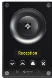
TCIS-6 | Audio Intercom