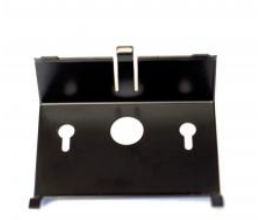
Wall Bracket for Desktop