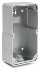
On Wall Back Box