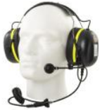
AK5850BHS Ex TwinCom Headband Headset w/ear plug connector

Ex-approved Headset with helmet mounting and connector for ear plug