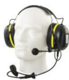
AK5850BHS Ex TwinCom Headband Headset w/ear plug connector