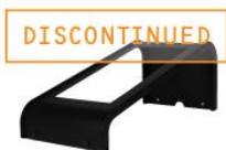
Desk Stand for IP Flush Master