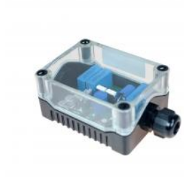
ELTSI-1 Exigo Industrial Line End Transponder