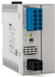
Power supply 100-240VAC/24VDC 2A

Switched-mode power supply, 1-phase, 24 VDC output voltage, 2A current