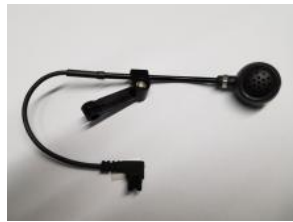
Spare Boom Microphone for Headset

Spare Boom Microphone for all A-Kabel type Headsets