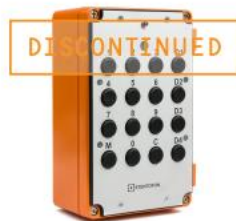
Industrial Master Station