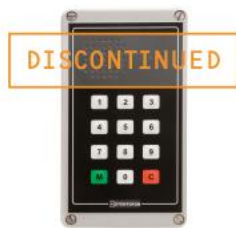
Light Industrial Master Station