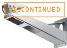
NXWBS1 Wall Bracket

EXPLOSION-PROOF COMMUNICATION BOX IN STAINLESS STEEL