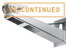
NXWBS1 Wall Bracket