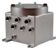
MBX2MAA Communication box

EXPLOSION-PROOF COMMUNICATION BOX IN STAINLESS STEEL