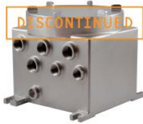
MBX2MAA Communication box

EXPLOSION-PROOF COMMUNICATION BOX IN STAINLESS STEEL