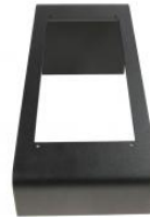
Single Desk Stand