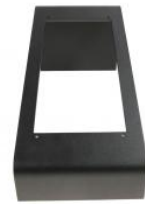
Single Desk Stand