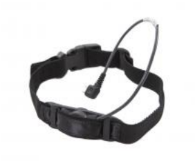
AK6070T Throat microphone for all A-kabel type Headsets