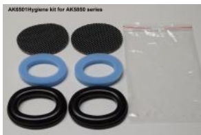
Hygiene kit for Headset