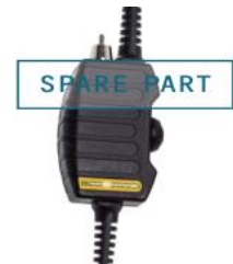
Spare Switchbox w/cable for VMP-36-PEL-Ad/15