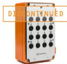
Industrial Master Station