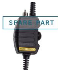
Spare Switchbox w/cable for VMP-36-PEL-Ad/20

Headset stowage Bracket for Wall mounting