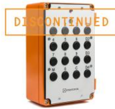
Industrial Master Station