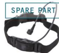
AK6070T Throat microphone for all A-kabel type Headsets