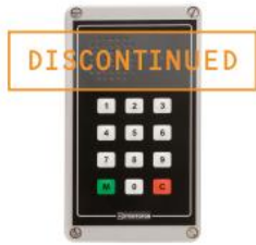
Light Industrial Master Station