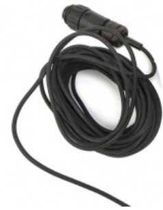
Spare Cable for P-MT7-A

Headset stowage Bracket for Wall mounting