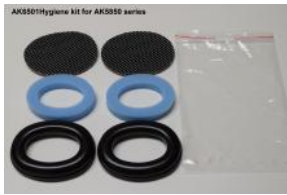
Hygiene kit for Headset