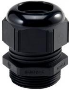
M40 Cable Gland for VSP Junction Box, preinstalled