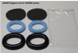
Hygiene kit for Headset