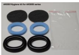
Hygiene kit for Headset