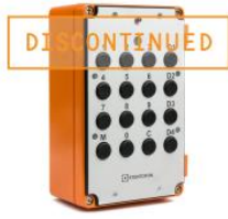
Industrial Master Station