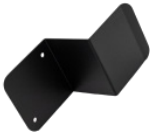
Headset Stowage Bracket

Headset stowage Bracket for Wall mounting