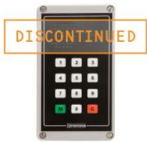
Light Industrial Master Station