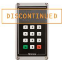
Light Industrial Master Station