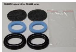
Hygiene kit for Headset