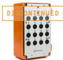
Industrial Master Station