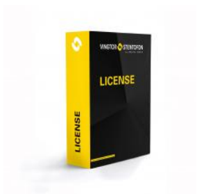
IP-ARIO Audio License