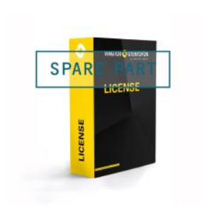
IP-ARIO Audio License