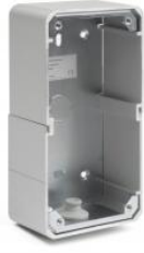
On Wall Back Box