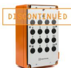
Industrial Master Station