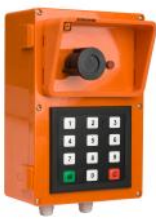
Industrial Master Station