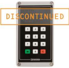
Light Industrial Master Station