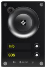
TCIV-5+ I Video intercom