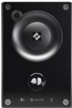
TCIV-3+ I Video intercom