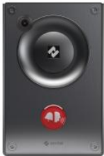
TCIV-2+ I Video intercom