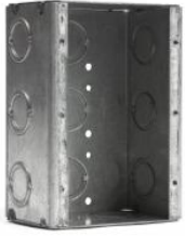
3 Gang Flush Mount back box