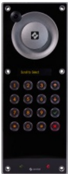
TEIV-1+ | Video Intercom with Keypad and Display

IP and SIP Video Intercom with Keypad and Display