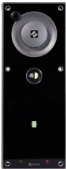
TEIV-4+ | Video Intercom with RFID card reader space

IP and SIP Video Intercom with Keypad and Display