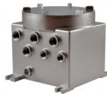
Ex Proof Communication Box MBX2MAA

EXPLOSION-PROOF COMMUNICATION BOX IN STAINLESS STEEL