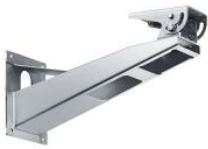
NXWBS1 Stainless steel wall bracket for NXM36K