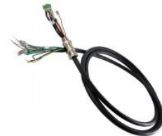
Armored cable MMXCABLARM4 , 4 meter

Armoured multicable with barrier gland 4m for MVX-MPX