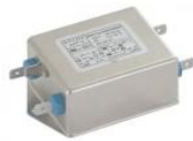
EMC Filter FM1010