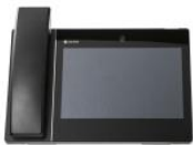
ITSV-5 HD IP Video Phone with 8" Screen