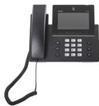
ITSV-4 HD IP Video Phone with 5" Screen