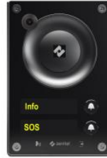
TCIV-5+ | Video intercom