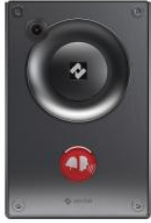
TCIV-2+ | Video intercom