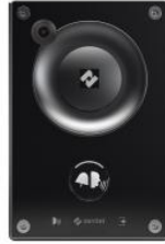
TCIV-3+ | Video intercom