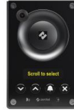
TCIV-6+ | Video Intercom