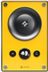
TCIS-1 | Audio Intercom