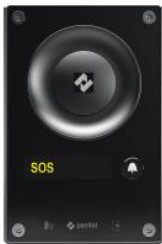
TCIS-4 | Audio Intercom