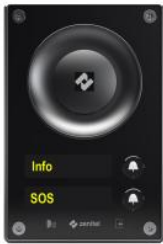
TCIS-5 | Audio Intercom