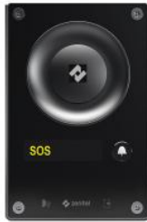
TCIS-4 | Audio Intercom