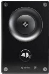
TCIS-3 | Audio Intercom