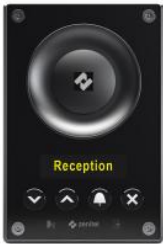
TCIS-6 | Audio Intercom