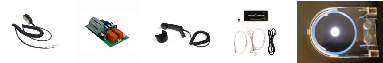
EMMAI-2H Item number: 1023533312 TA-10 Item number: 1008140100 TA-23 Item number: 1008140230 EPIPR-6 Item number: 1023697006 EGA-1 Item number: 1023594100