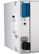
POWER SUPPLY 100-240VAC/48VDC 5A