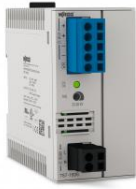
POWER SUPPLY 100-240VAC/24VDC 2A