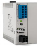
POWER SUPPLY 100-240VAC/48VDC 2A