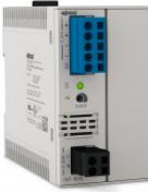
POWER SUPPLY 100-240VAC/24VDC 4A