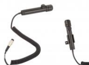
PAM2H Item Number: 1023533013