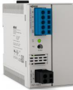
POWER SUPPLY 100-240V AC/48VDC 2A