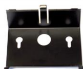
WALL BRACKET FOR DESKTOP